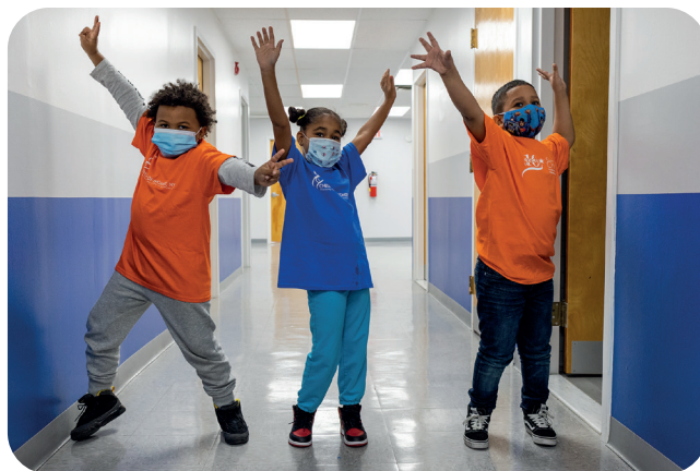
Children of Promise

CPNYC is continuing to work with Cause Effective to build out its development and communications team, giving its dynamic leader a chance to finally have the room to be the visionary head of this organization that does so much to help Black and Brown children and youth thrive.